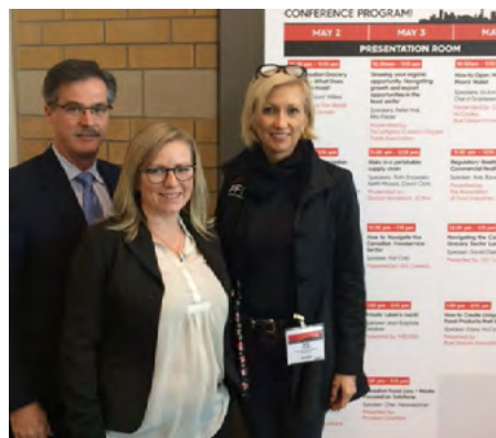
COTA Panel Speakers at SIAL Canada 2017