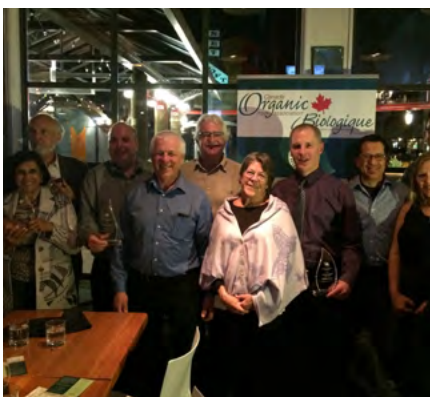
Award Winners of COTA's First Organic Leadership Awards, Vancouver, BC

This year, we also expanded our partnership with SIAL Canada to continue broadening our presence in diverse trade forums. For the first time, we hosted a Canada Organic pavilion for member companies to exhibit and continued our presence representing the organic industry at the SIAL Expert Hub and as a key presenter of the show.