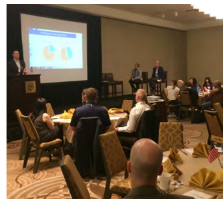
COTA's Annual Business Builder's Breakfast at Natural Products Expo West, Anaheim, CA, USA